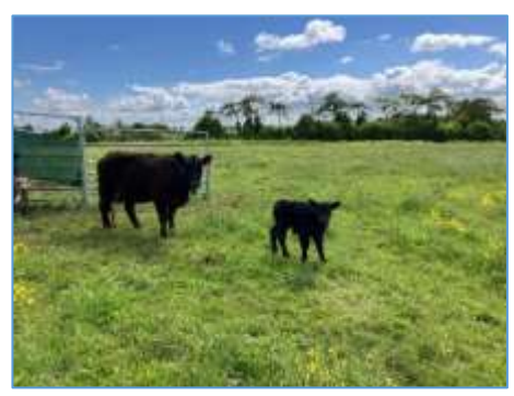
Black Galloway heifer and calf

The Belted Galloways are doing well and have now become thoroughly accustomed not only to our site but also to the NoFence technology which uses GPS to govern where they graze. The three pregnant heifers have each produced one fit and healthy calf, and for the time being these mothers and calves are being kept separate from the main herd. They are currently grazing in the Reversion Field, while the remaining