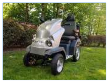
A typical tramper

The project is supported by the board of CNL, which provided the specialised camera and the hire of the tramper (an all-terrain mobility scooter).